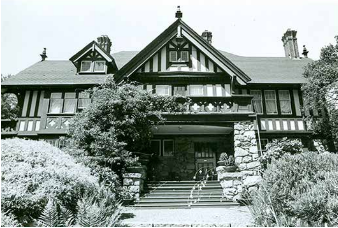
1770 Rockland Avenue - 1978.

1770 Rockland Avenue is a three-storey stone and stucco Tudor Revival mansion located in Victoria's prestigious Rockland neighbourhood. It is a representative example from architect Samuel Maclure's pre-war phase, generally considered to be his most innovative and vigorous period.