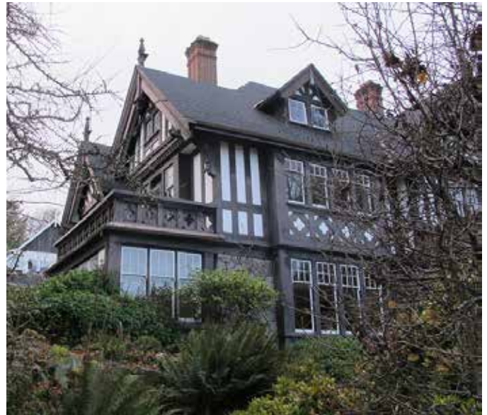
1770 Rockland Avenue, view from the southwest.

chimneys, the Tudor Revival style is closely associated with the Victorian, Edwardian, and Arts & Crafts styles. The half-timbering found on this type of house is derived from Elizabethan England, where heavy timber structural frames were infilled with masonry panels. This building type became popular in Vancouver and Victoria between 1900 and the 1930s, particularly because of political and cultural ties to Britain. Mansions were set in gardens that formed part of the living space.