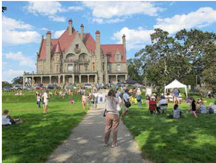
Grounds of Craigarroch Castle.

Visitors were entertained by a professional jazz ensemble that had them up dancing and singing along. The day concluded with a draw for prizes donated by sponsors and the singing of “Happy Birthday” followed by the distribution of cupcakes – no birthday is complete without cake, after all. There were smiles on all the faces – a fitting end to a wonderful day.