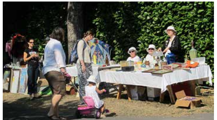
Garage sale on Despard Avenue.