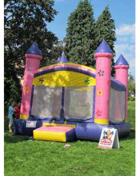
Bouncy Castle.

The highlight of the activities for some folks was the display of vintage automobiles along Manor Road that was closed off specifically for the day. Young and old alike wondered at the magnificent cars on display. The Rockland Neighbourhood Association offers its sincere thanks to all members of the Vintage Car Club of Canada, Victoria Branch who helped to make The Rockland Stroll a great success.