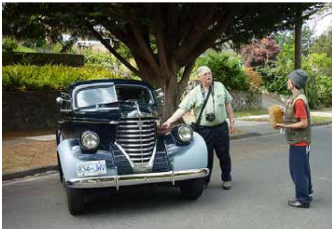
Vintage car display on Manor Rd.

The remainder of the activities began at Noon. The Langham Court Theatre offered backstage tours, silent movies and a fashion hour: Fashions from 1852 to 2012. The Art Gallery of Greater Victoria featured a book signing of The Spencer Mansion: A House, A Home , and an Art Gallery and a public tour of the exhibition: Silk Splendour .